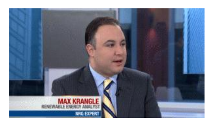
Watch the clip.